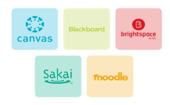
Figure 2. Examples of Learning Management Systems

Integrated with Your LMS/VLE - Kaltura integrates with all major Learning Management Systems/Video Learning Environments, (Moodle, Canvas, D2L, Blackboard, Sakai) so you can seamlessly add video to the tools your users depend on.