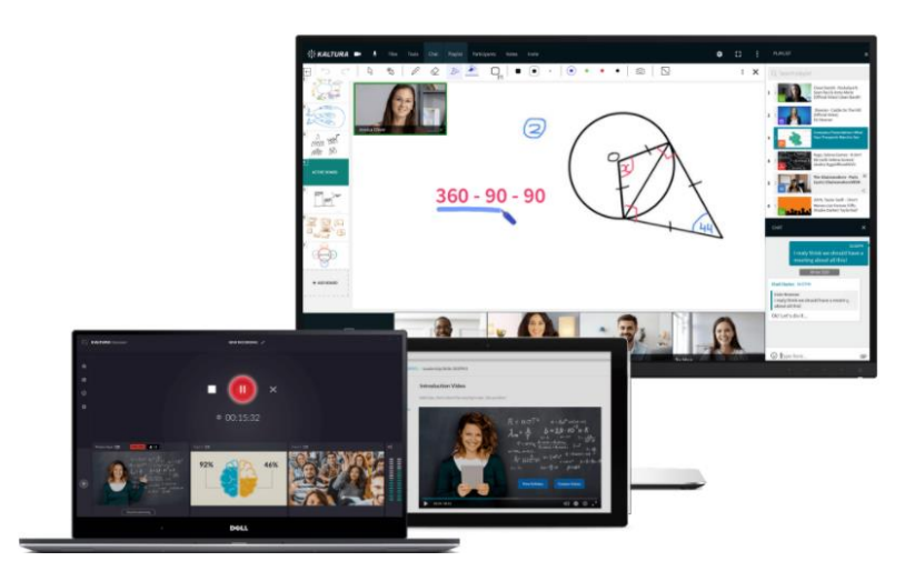
Figure 5. Example of Kaltura Video Cloud for Education

Video Management - A video portal that makes it easy for teachers to know where to upload videos and is even easier for students to find the videos they need to watch. Videos can be organized in channels that are only available for students in the class to watch while teachers can use the same video in multiple classes. Not only are videos organized by classes, but students can use rich search functions to find videos that cover specific topics. Video management portals, like the Kaltura Media Space, not only provide a central space to manage and access all videos within a class and school but also provide enrichment tools to extend the reach of videos. Teachers can automatically caption their videos with machine captioning and edit their captions to get them just right. Tools like captioning make it easy to find videos in search as well as help make sure that no student is left out.