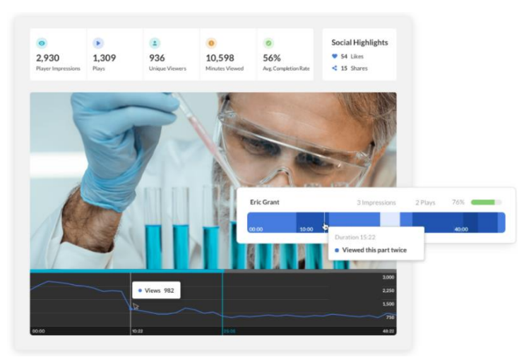
Figure 4. Example of Kaltura Granular analytics

Accessible by Design - Kaltura products adhere to 508, CVAA, and WCAG 2.0 AA accessibility standards with workflows and tools such as transcription, translation, audio description, automatic chaptering, and much more for greater inclusion.